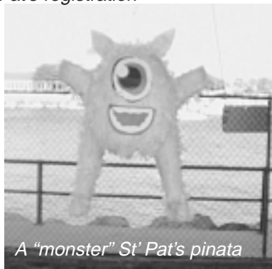
A "monster" St' Pat's pinata