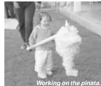
Working on the piñata.

The Chapped Cheek regatta is designed to provide ABYC members with the maximum amount of participation using the minimum amount of volunteers. By limiting keelboats and catamarans to the ocean courses, and assigning the dinghies to the bay, a few volunteers can run the races so everyone else can sail! Rob and Jim Fuller, the regatta chairmen, and fourteen of their closest friends staffed the bay and harbor racecourses as well as shore support. Normally it requires a least thirty to forty volunteers!