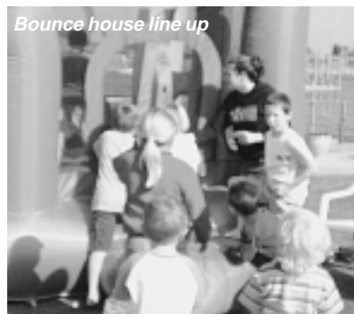
Bounce house line up