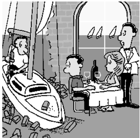
He's still working on his docking skills!