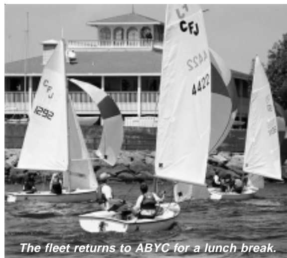
The fleet returns to ABYC for a lunch break.