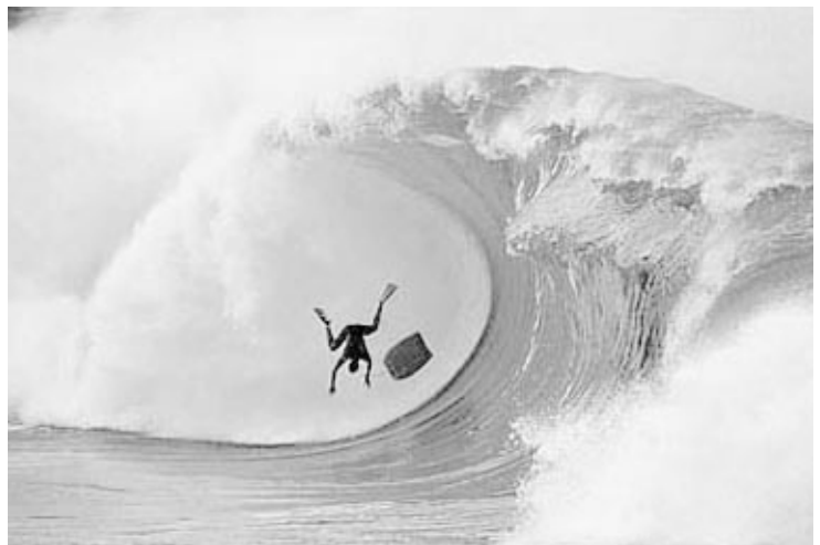
Anonymous dinghy skipper making poorly timed beach landing at 2003 STAG cruise - Emerald Bay, California

All concerts are on Sunday from 5:30 – 7:30 p.m. @ the 72 nd Place Park next to ABYC