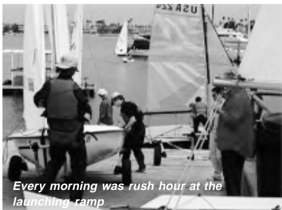
Every morning was rush hour at the launching ramp