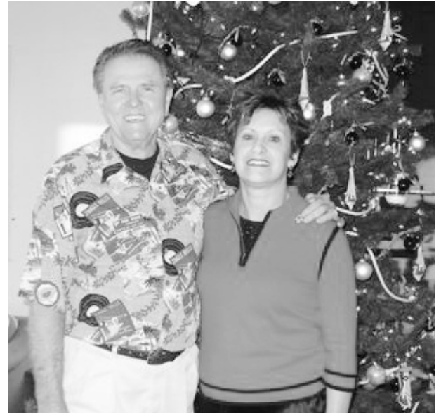
Ron and Elaine Wood