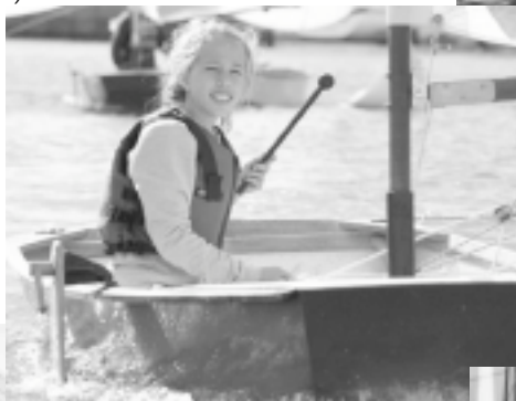
Smiles and Sabots go together.