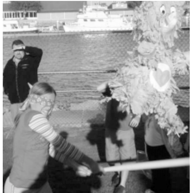
Pinata killer at St. Pat's Party.