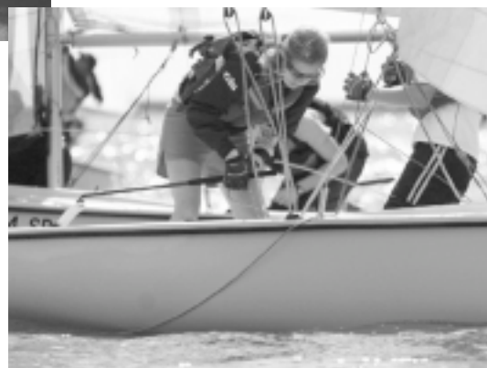
Spinnaker down, sheets secured, ready to go upwind.