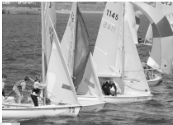
This is where foredeck crews earn their keep.