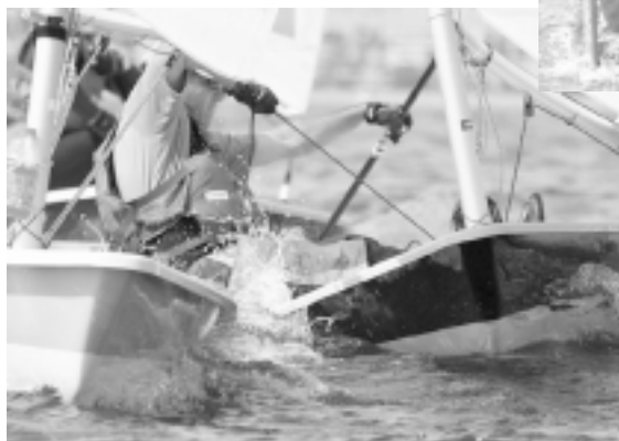
This is how Lasers raft up.