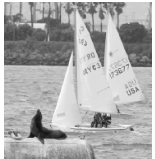
This spectator had a front row seat.