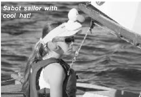
Sabot sailor with cool hat!

"These were my conditions," Raab said. "I like light air, and I'm going to make a big push for the Trials in Newport Beach."