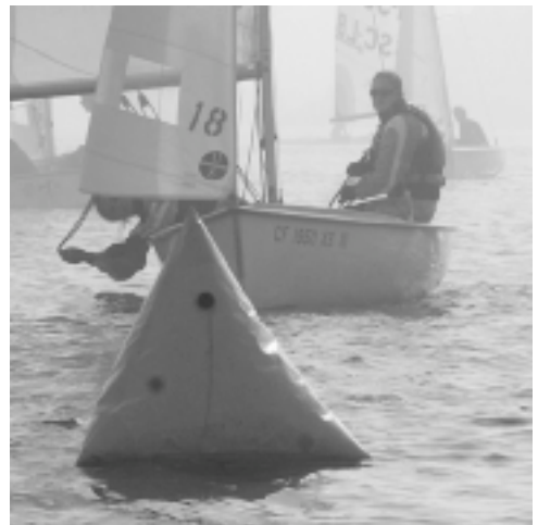
Sailors had to find their way in the fog for part of Sunday's racing.