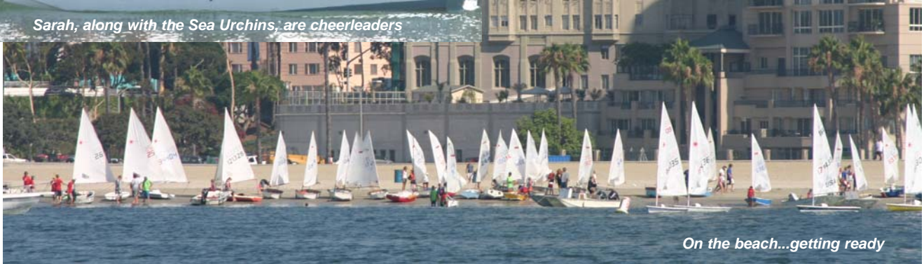
On the beach...getting ready