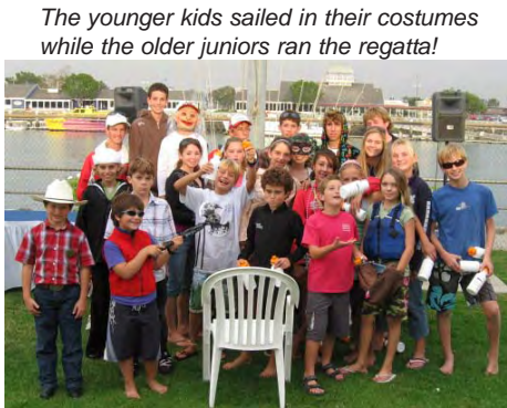
The younger kids sailed in their costumes while the older juniors ran the regatta!