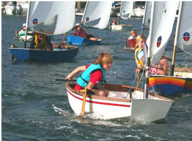
Naples Sabot sailors of all ages competed in six classes

W ith all of those turkeys awaiting the winners, Alamitos Bay Yacht Club almost needed the wishbones to settle some of the class championships in their annual Turkey Day Regatta Saturday and Saturday. Among 262 boats in 17 classes, four titles were determined by tie-breaking rules when leaders completed the six-race schedule even in points, and a few others were hanging in the balance to the end.