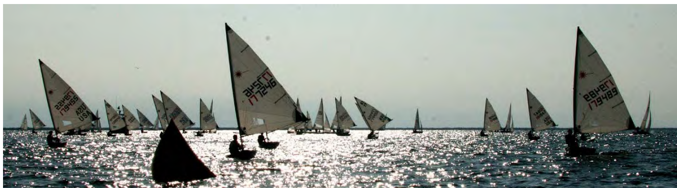
A beautiful day on the water