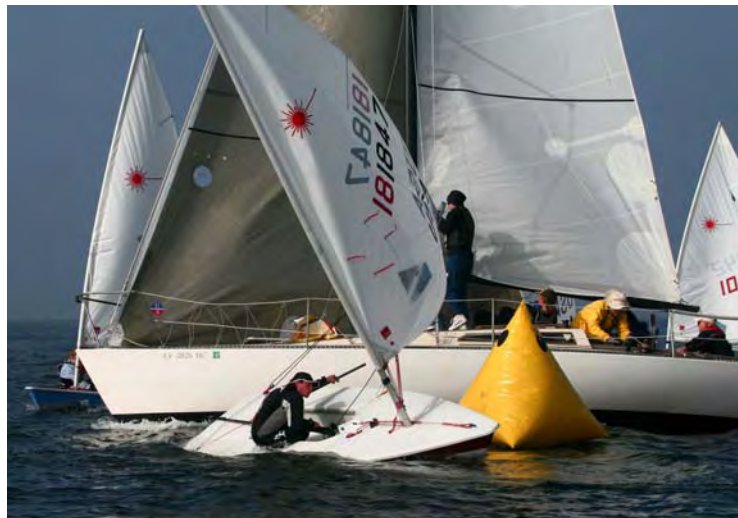
Olson 30s had to pick their way through the Laser Radial fleet at the windward mark