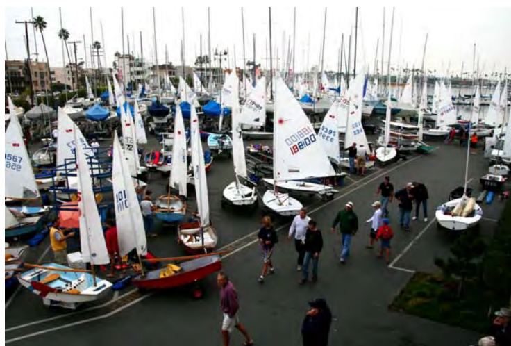
A busy yard during Turkey Day Regatta