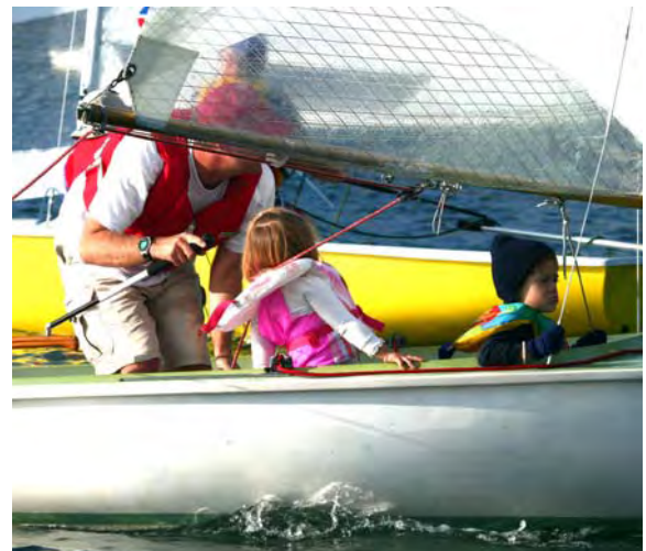
Turkey Day Regatta is a family affair