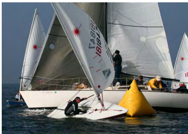
Olson 30s had to pick their way through the Laser Radial fleet at the windward mark