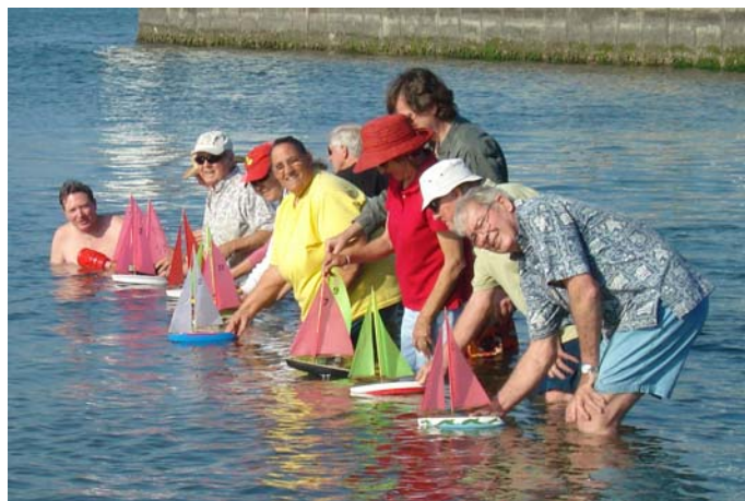
Ready, Set, GO! Racers eager to start the pinewood race. The bay water was warm and summer evening on the bay was perfect!

headed for Campbell River to again fix that pesky generator, (loose wire to the fuel pump), and the propane stove that was on strike, (leave the vented lid ajar and no problem). The Boonies were the only cruising boat in Squirrel Cove, April Bay, Echo Bay and Refuge Harbor although at Refuge they were joined by a family of Canada geese who were very noisy and loved French bread. Going north