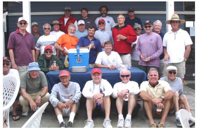
The 2007 Men's Day participants