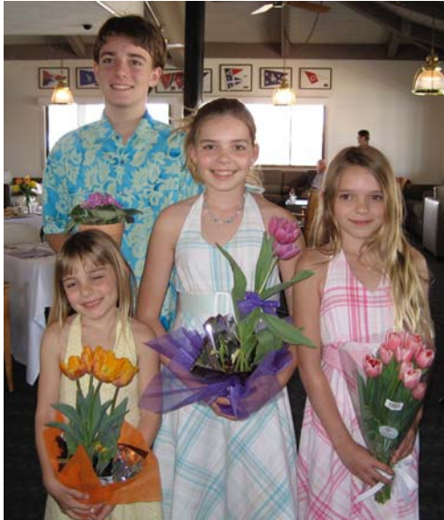
The Luckey family