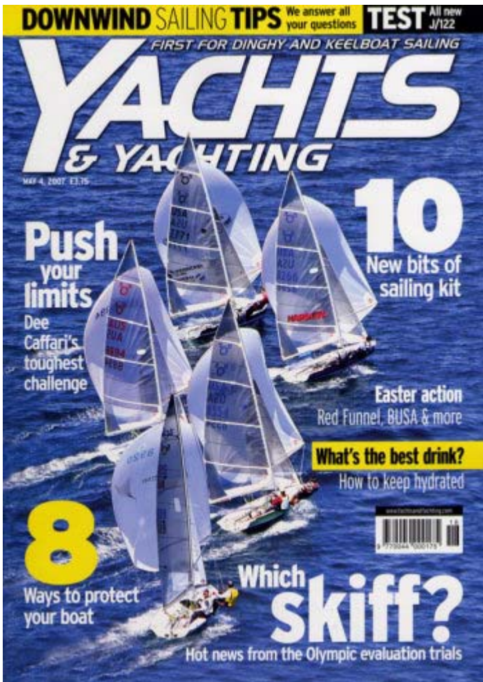
Kevin Taugher is lead boat, on cover of magazine, sailing 505 Worlds

PRSRT STD U. S. Postage PAID Long Beach, CA Permit No. 685