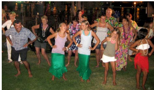
Luau - audience participation