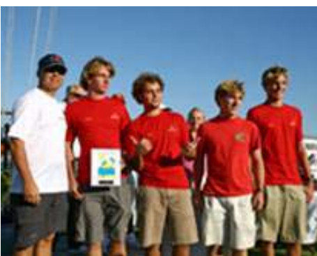
LBYC Juniors accept first place award in Catalina 37 class