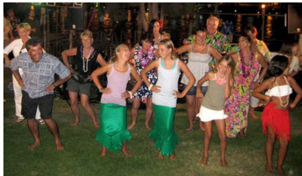
Luau - audience participation