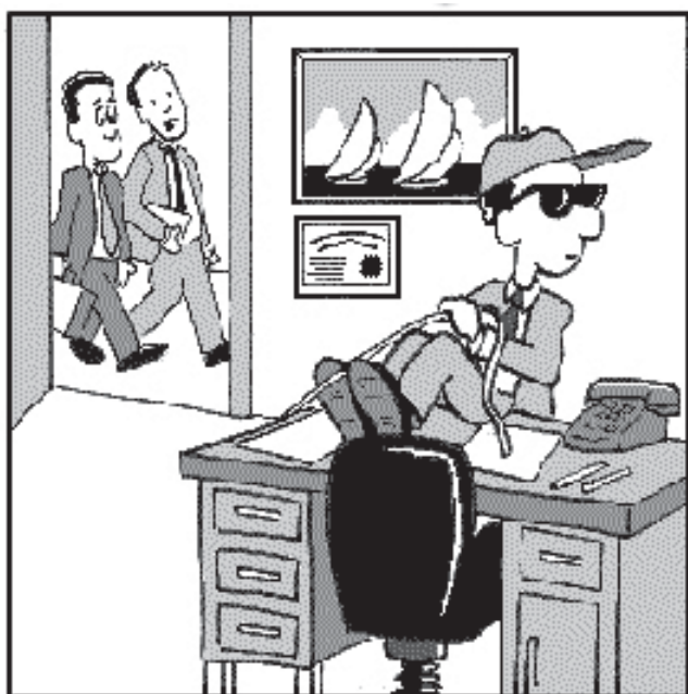
He races all weekend. It takes a day or two for him to get his corporate legs back.