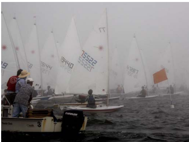
The other end of the start line faded away