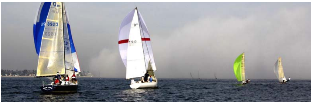
Olson 30s run downwind toward the beach that is being obscured by fog rolling in from the right

All three courses—two on the outer harbor and a third for the smallest boats inside the bay—suddenly were sailing in 30 to 40 yards of limited visibility in light southeasterly winds topping at 7 knots, and speed became secondary to finding course marks.