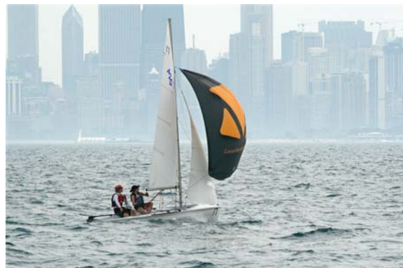
Bemis skyline photo