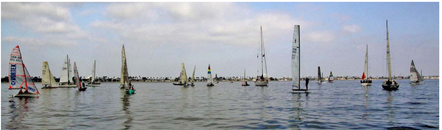
Frustrated fleets of high-speed boats on Alpha course waited in vain for brisk wind to arrive Sunday