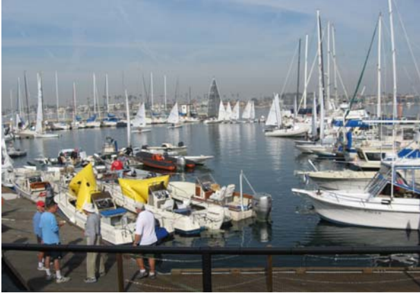
The Basin - ready for Turkey Day

PRSR STD U. S. Postage PAID Long Beach, CA Permit No. 685