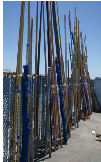
Please claim your spars and loose items from the east yard

Jeff Merrill – 949.355.4950 jeff.merrill@nordhavn.com