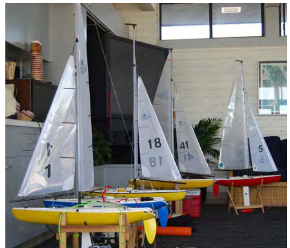
Nirvanas ready to launch