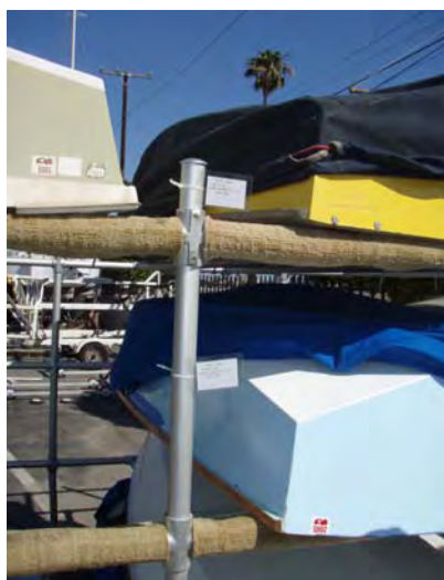
Laminated tags indicate new spaces