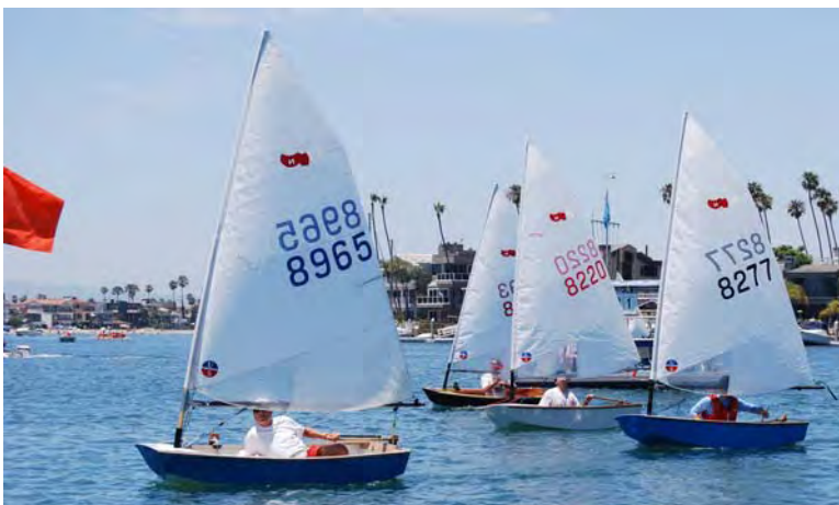
Racing toward the beer boat