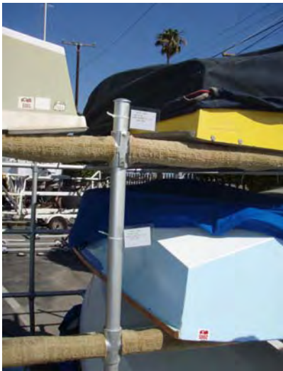
Laminated tags indicate new spaces