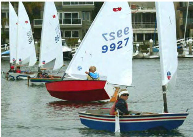
Young Sabot sailors follow the leader