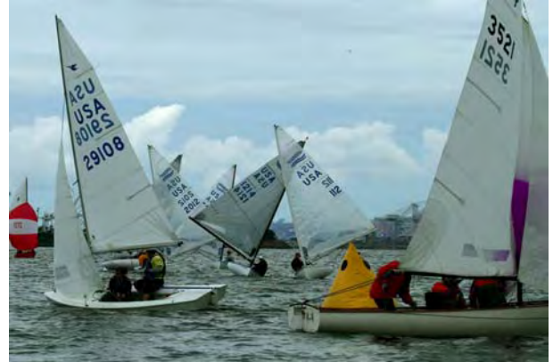
A mix of classes converge at the leeward gate