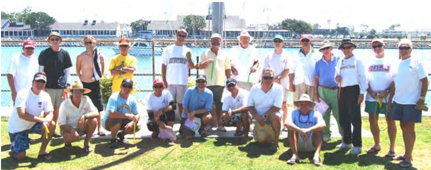
Men's Day participants