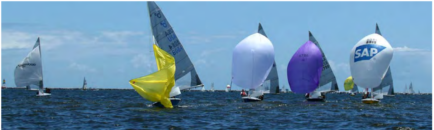
The 505 fleet parades downwind in light air that marked the two-day regatta in Long Beach