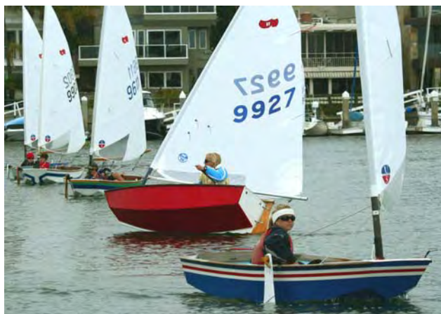
Young Sabot sailors follow the leader