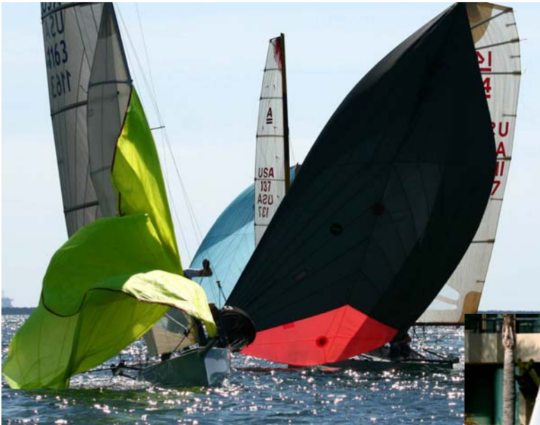
I-14s cross near the leeward gate