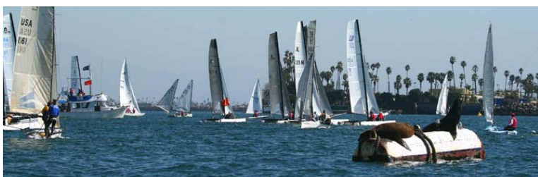
Harbor seals check out Formula 18 catamarans starting line. There were 109 boats in 11 classes

H osts or not, winning comes natural for ABYC's sailors. Not to be an ungracious host, but small sailboats are Alamitos Bay Yacht Club's business, which is why its sailors won most of the prizes while running those classes in the Southern California Yachting Association's 79th Midwinter Regatta Saturday and Sunday.