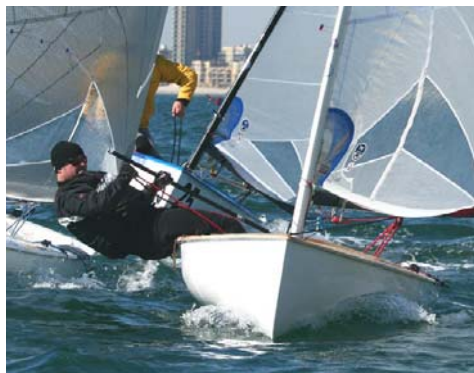
Sailing a Finn is no day at the beach

The weather was sunny, if cool in the lower 60s, and winds were 6 to 12 knots, peaking late Sunday afternoon as competition wound up.