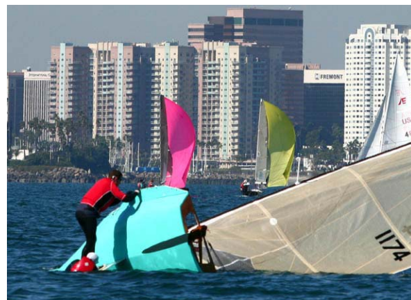
An I-14 flipped in front of downtown Long Beach