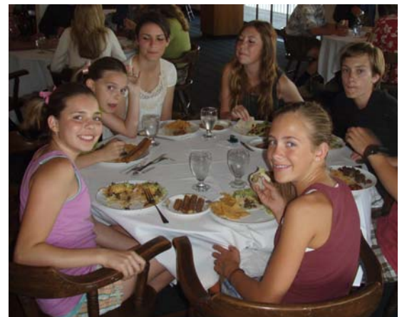
Now it is their turn to enjoy dinner after serving