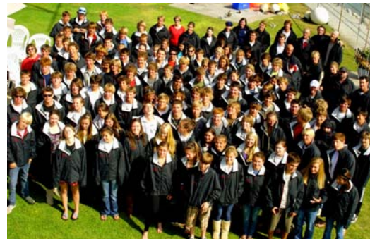
CISA Class of 2008