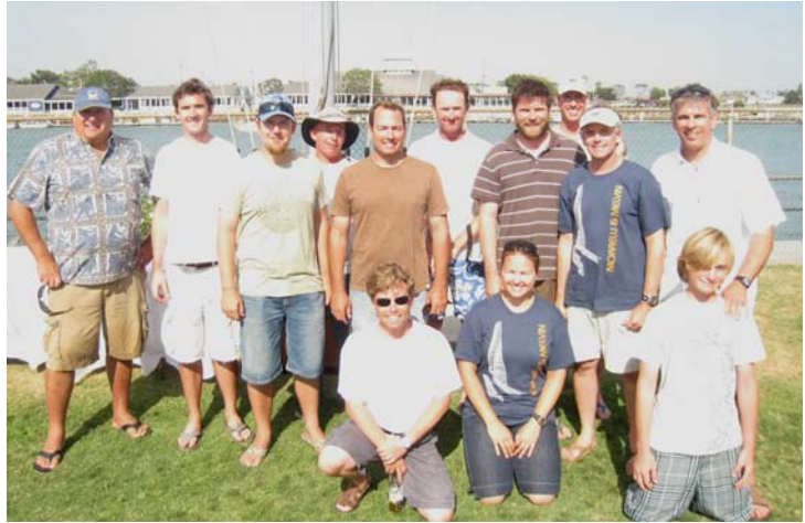
The F18 group.