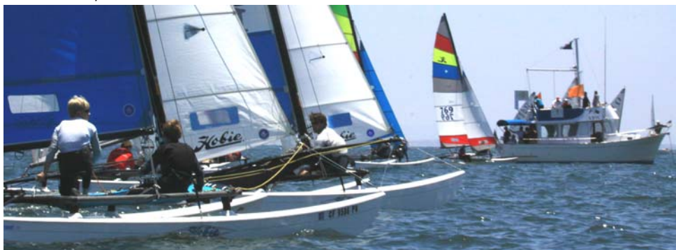
Hobie start - Memorial Day Regatta