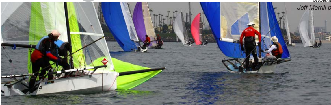
International 14s work their way downwind. Breeze was light in outer Long Beach Harbor Saturday.