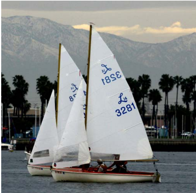
Lidos in the Bay with the mountains in the background