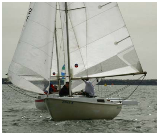
Cal 20s wing-and-wing downwind