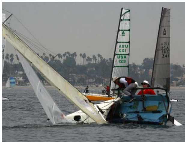
Crew wrestles their I-14 upright