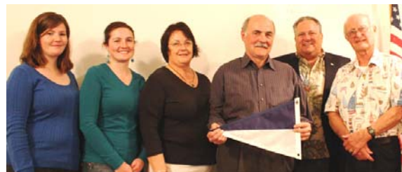
The Duphily Family