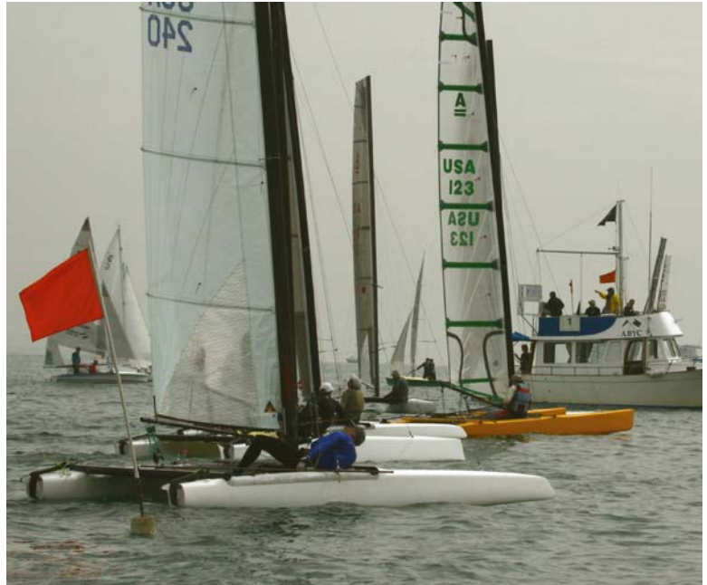
A-Cats lead off the regatta in 4 knots of wind