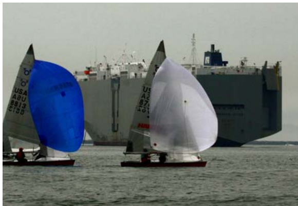
Racing around a car transporter