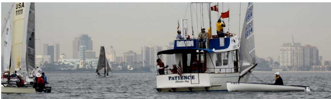
An uncommon sight: the ABYC committee boat pointing upwind – toward the beach and downtown