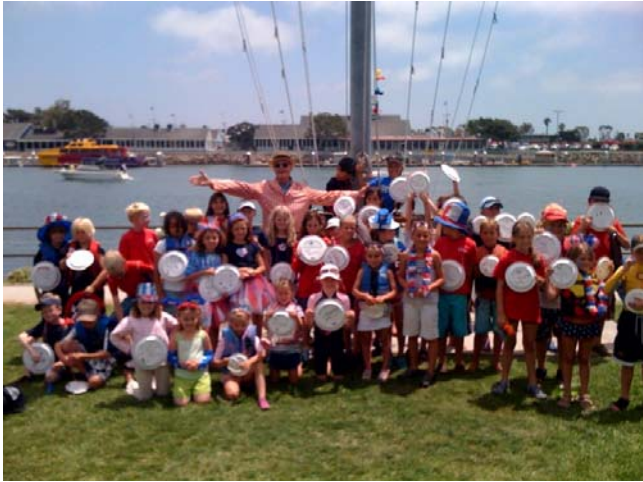
The younger Juniors celebrate 4th of July

PRSR STD U. S. Postage PAID Long Beach, CA Permit No. 685