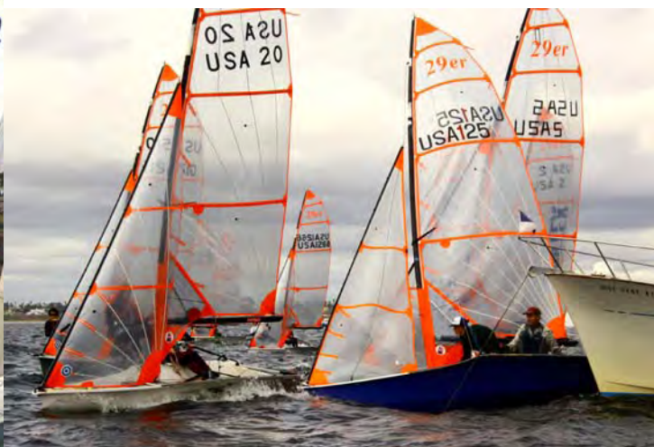
29er start on Brovo course