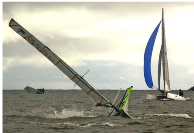
Weather or not, they're out racing for turkeys in Long Beach

Rain or whatever, racing will resume at noon Sunday, conditions permitting. All classes are scheduled for a total of six races.