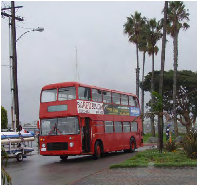
The Big Red Bus transports competitors up and down the peninsula