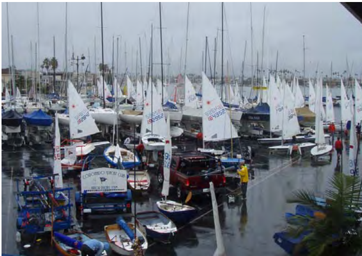
Lasers are not afraid of the rain