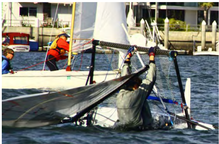
What was that Moth doing with the Lidos and Sabots?