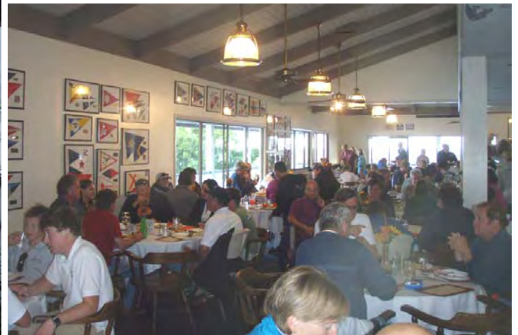
The crowd enjoying Turkey Day dinner.

Boxing Day Regatta December 26th Be there!!