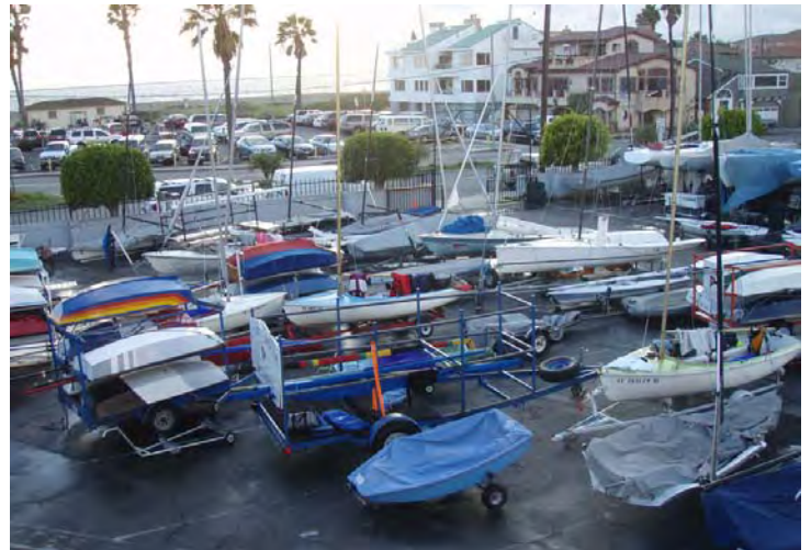
Our parking lot taken over by boats.