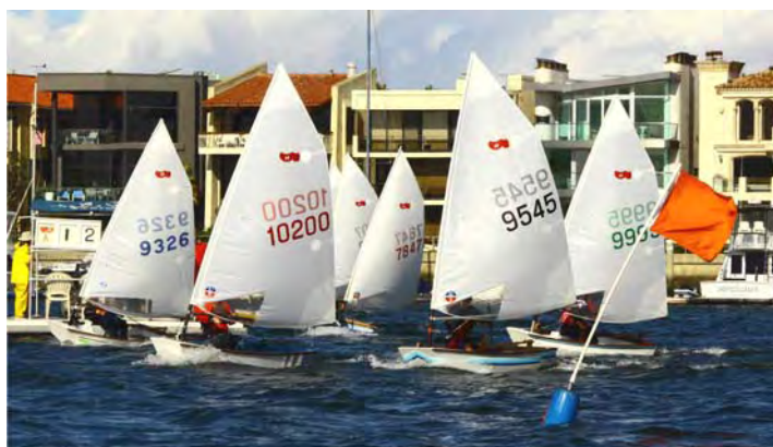
A brisk breeze start for Sabots