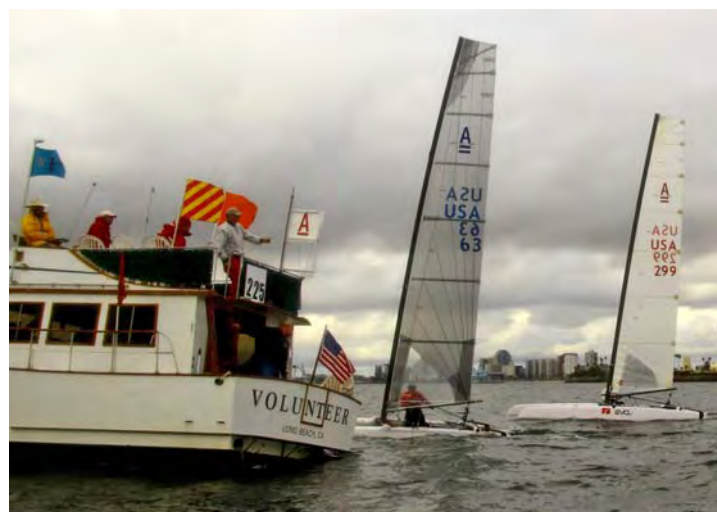
A Cat start on Brovo course