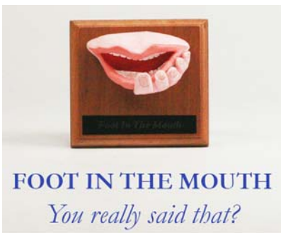
FOOT IN THE MOUTH

Fleet captain, Ed Spotskey, a.k.a. "Blazer Boy", acting under the color of authority, is charged with attempting to extort extra dues from non-ABYC members of Fleet Six. After immediately pleading guilty, he begged for public forgiveness.