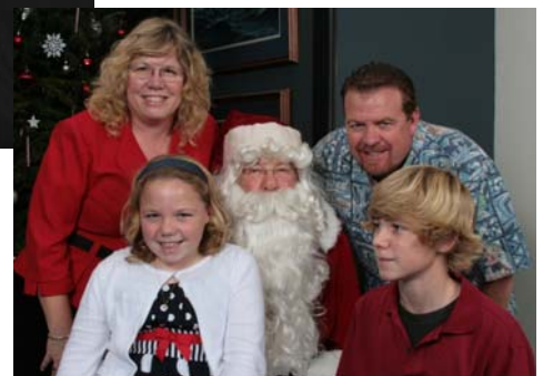
The Rice Family