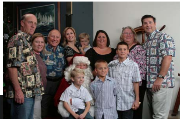
The Fox and Peoples Family