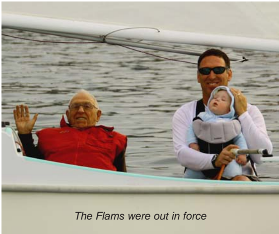
The Flams were out in force