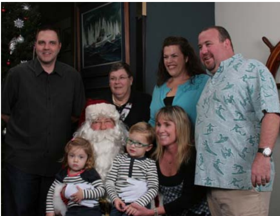
The Morford family