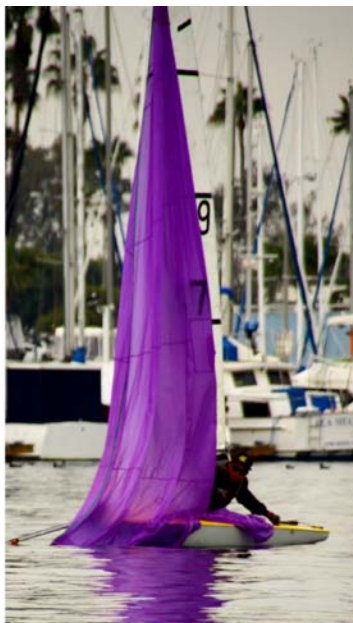
Too wispy for spinnakers