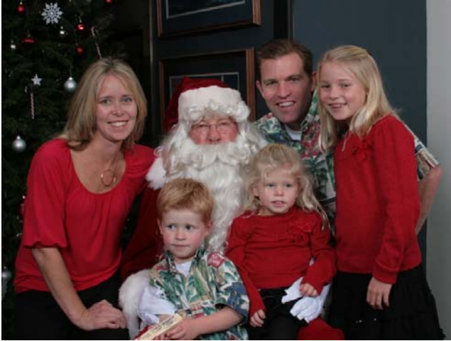
The Meyers family