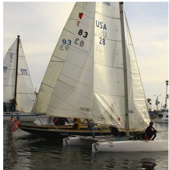
Glaser's cat drifts past Shields