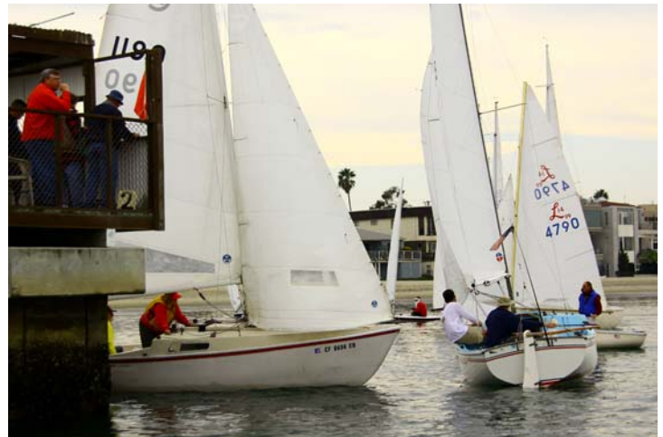
Cal 20s set up for their start