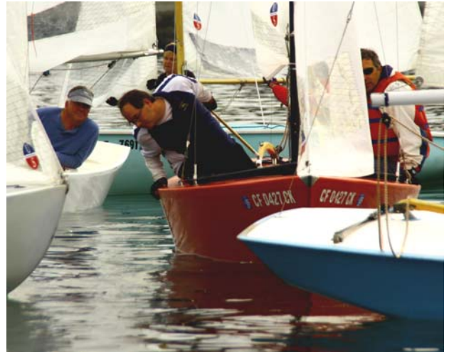
Are we really moving?

Complete results and photo gallery at: abyc.org Rich Roberts