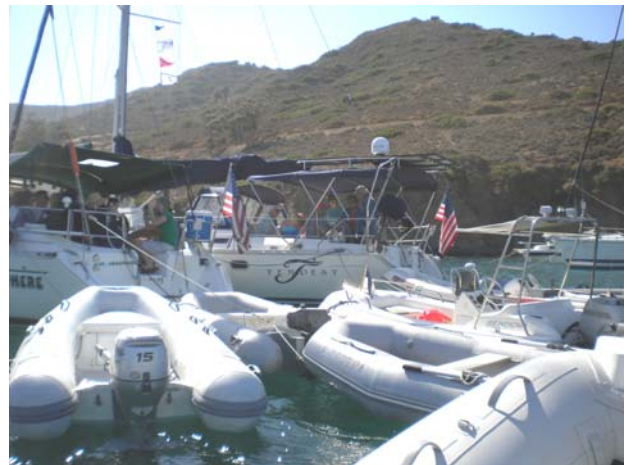
A Catalina traffic jam!