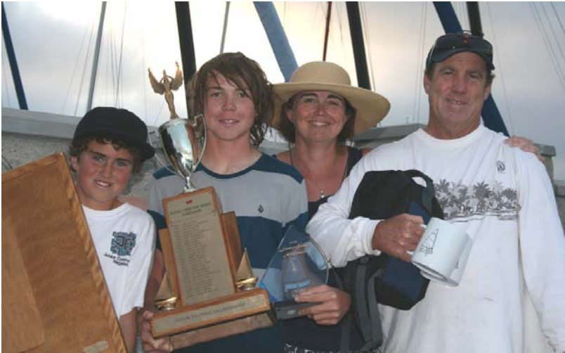
The proud Gibbs family...see article beginning on page 9