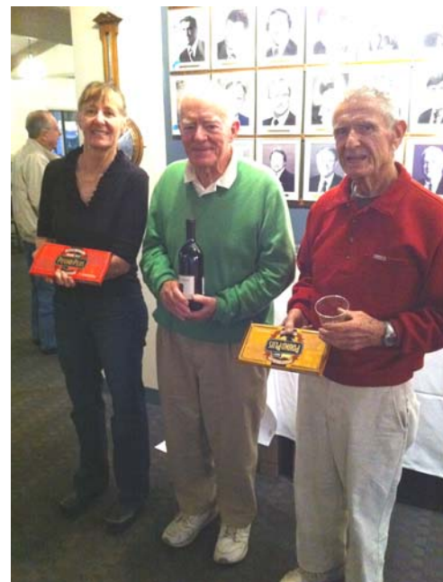
Chocolate bar trophy winners