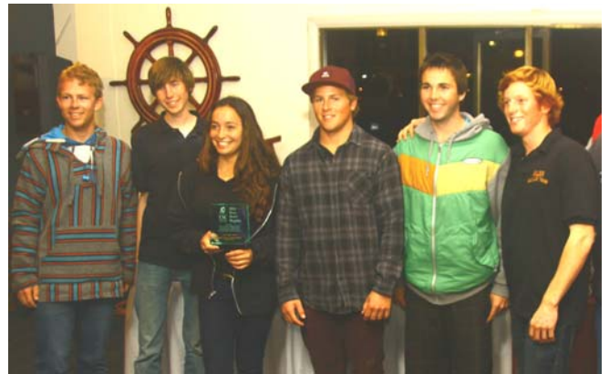
High school Gold: Point Loma