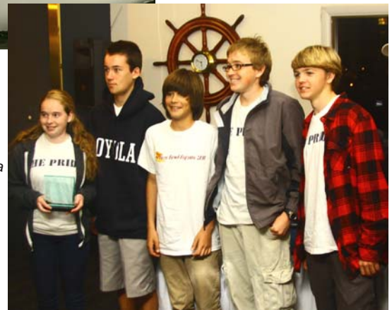
High school Silver: Loyola