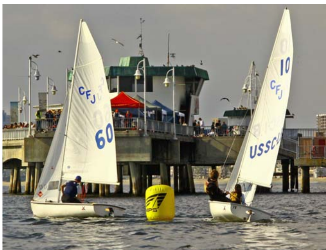
Spectators had front-row seats on Belmont Pier

ABYC on December 31 was a great evening. In spite of the cold night and remodeling we had a terrific group of members to celebrate 2010! The furnace was not available, but the fireplace did its job and kept us pretty warm. The hors d'oeuvres the celebrants brought were delicious and plentiful, if you went home hungry you didn't come to the table often enough.