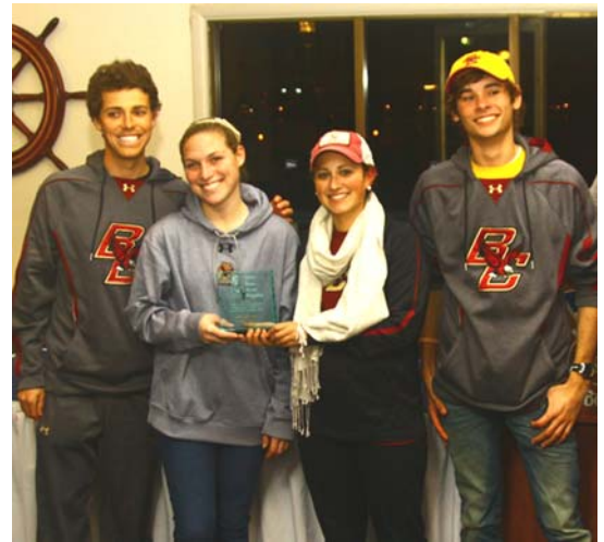
Collegiate: Boston College