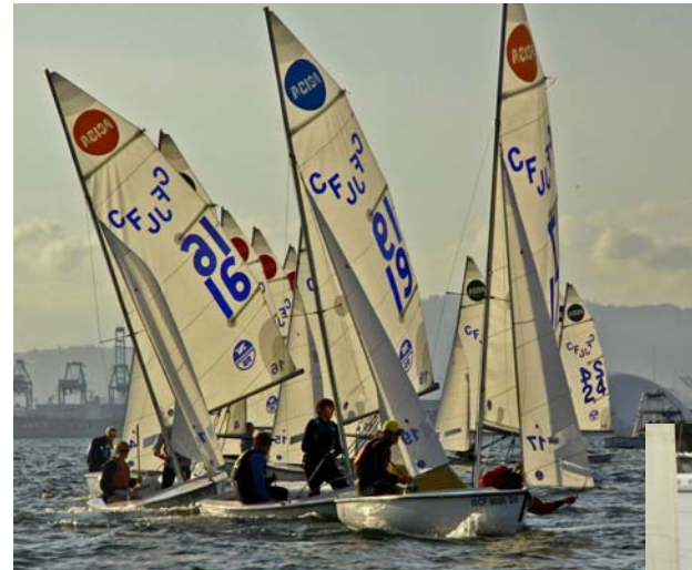
High school Gold fleet romps downwind on outside course