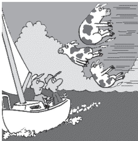
Reliable storm indicators!