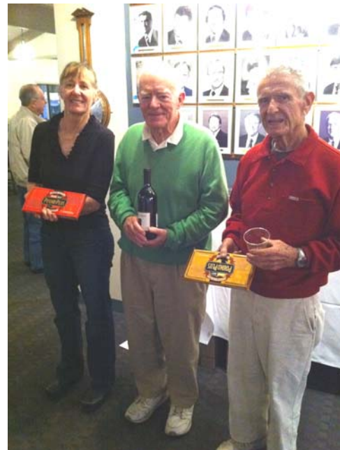
Chocolate bar trophy winners