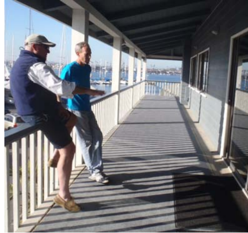
New carpet on upper deck