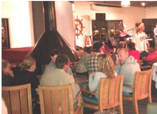
Visiting by the fire at Chili Cook Off